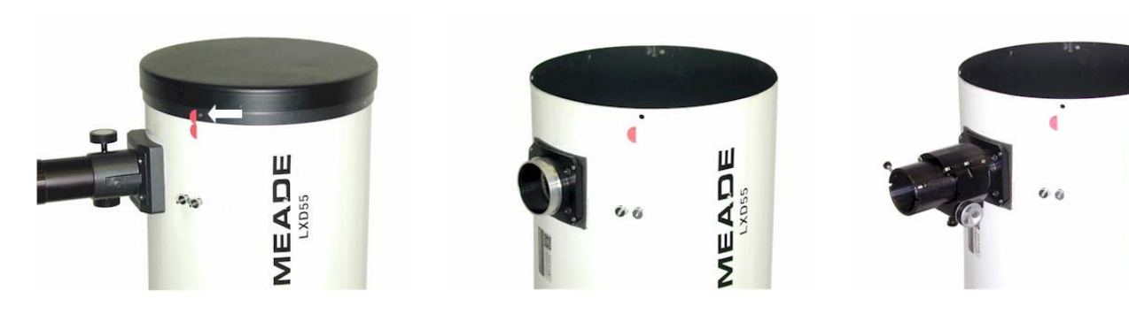
Figure A Figure B Figure C